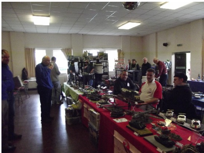
A busy show - The Romford Club tables in the foreground

Other aircraft were a selection of jet and prop, with the military dioramas being provided by 'you know who'.