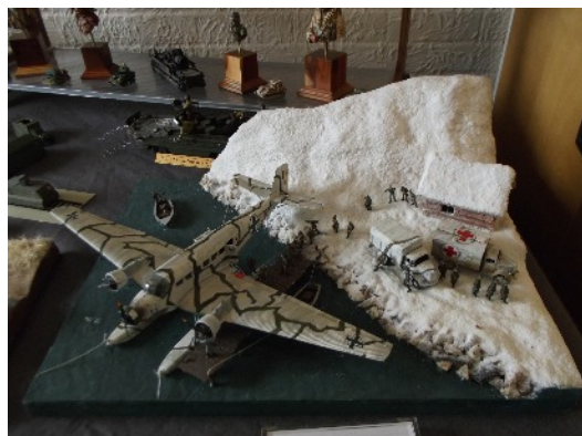
An unusual Junkers 52 floatplane seen at the show

Traders were Brigade Models and M.A.N. Models, and business looked to be brisk with plenty to see and buy.