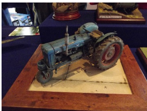
Something a little different, seen at On Tracks. It looks like real mud on the tyres