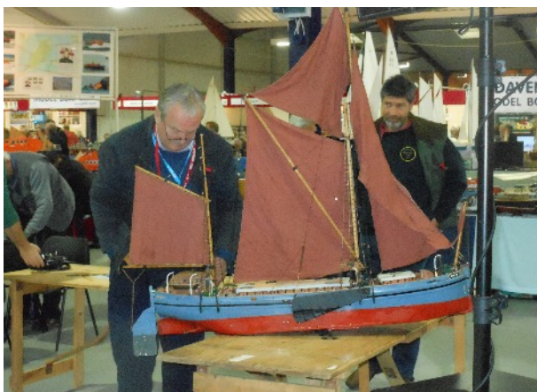
Always a favourite. One of the Thames Sailing Barges exhibited by the Thames Barge Model Association

machines could be a wonderful asset for a club like ours.....sigh!