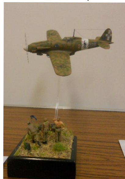
Macchi Folgore with spectators