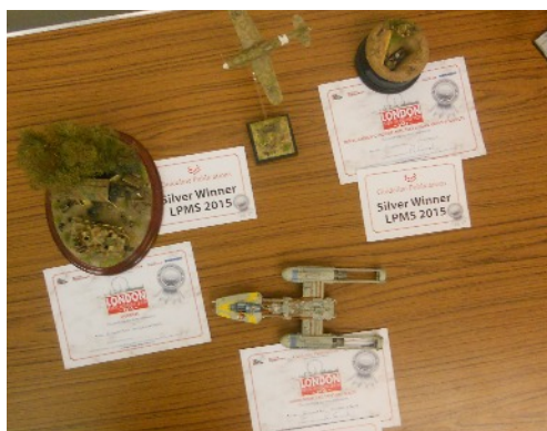
Nick R's silver awards from the London Plastic Model Show