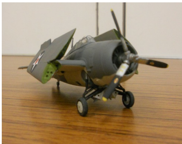
Derek H's Wildcat tucked up and ready to go below.