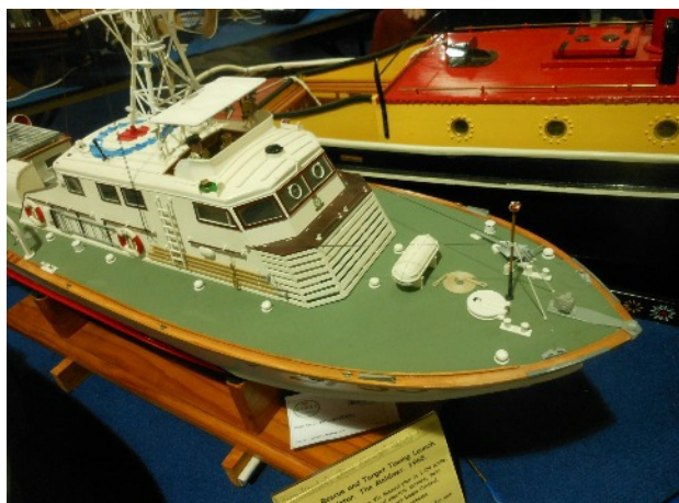
Vosper Thornycroft Air Sea Rescue Boat in service in the Maldives

less evident although a couple of 3D Printers caught our eye which were realistically priced between just under £300 and just under £500. Examples of their