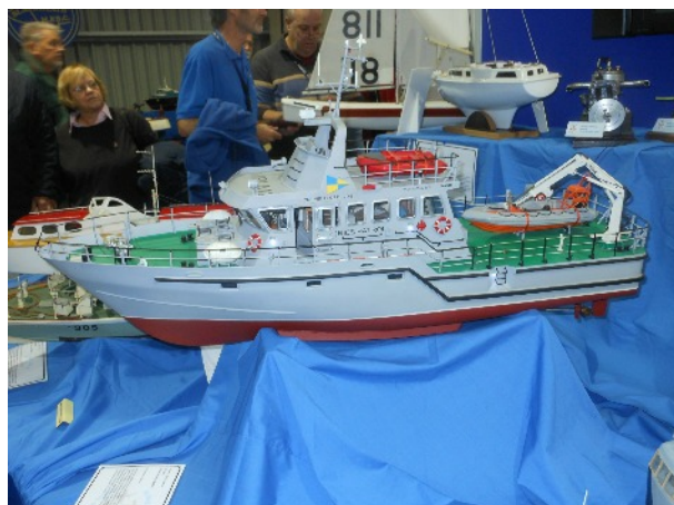
Drumbeat a popular off shore patrol boat in 1/24 th scale

work included some very intricate machine guns in 1/16 th scale (the German Spandau Machine gun was very convincing and looked as if it might fire real bullets!) One of these