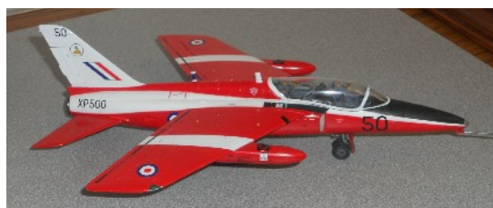
Not sure who made this Gnat, but it's great!

Maybe these will inspire some models to display at our Hailsham Model Show 2016?