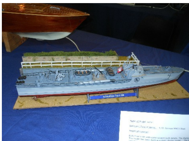
An Italiere E-Boat - creatively displayed.

Tools and modelling materials seemed to be