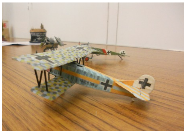
Fokker DVII made by Terry, look at that lozenge camouflage!!