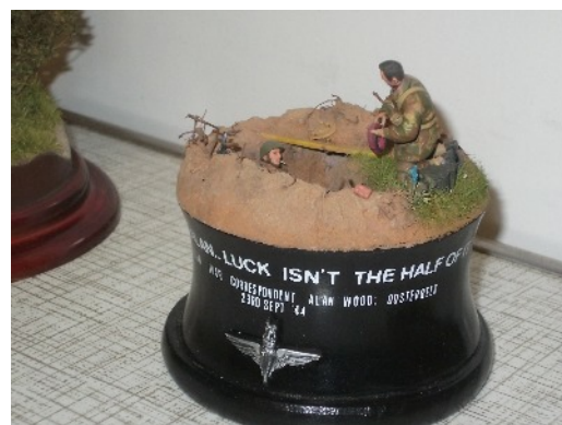
A prizewinning little vignette from Nick R showing a couple of paratroopers in their foxhole