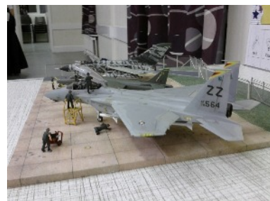
More 1/72 scale jet hardware from the R.Harris stable