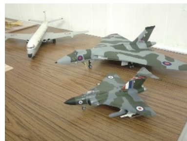
A selection from the prolific Mr D Hersey in 1/72

(A selection of models brought to our meetings )